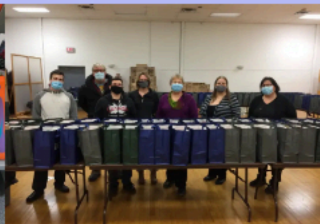
Senior Care Package

A special THANK YOU to all our volunteers, sponsors, partners, donators and local businesses for the support they have shown the Schreiber Public Library.