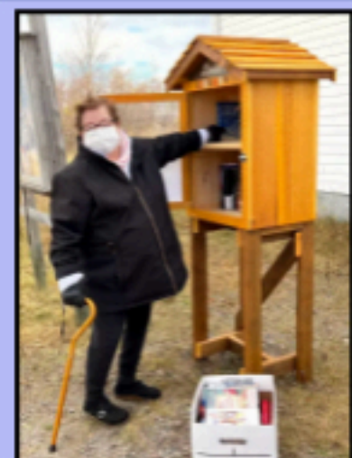
Linda's Books Free Little Library