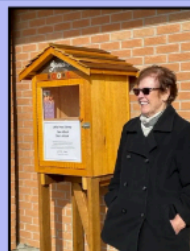
Janet's Books Free Little Library

A special THANK YOU to all our volunteers, sponsors, partners, donators and local businesses for the support they have shown the Library.