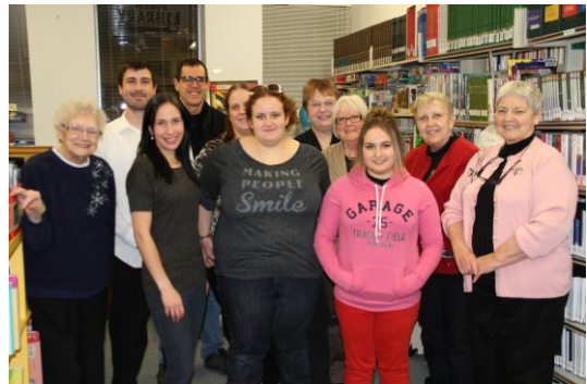
Library Staff and Board